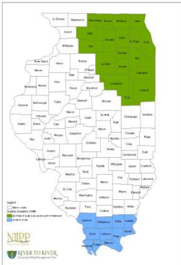
Implementing the Forest Campaign Plan Using Cooperative Weed Management Areas CWMA Geographic Coverage