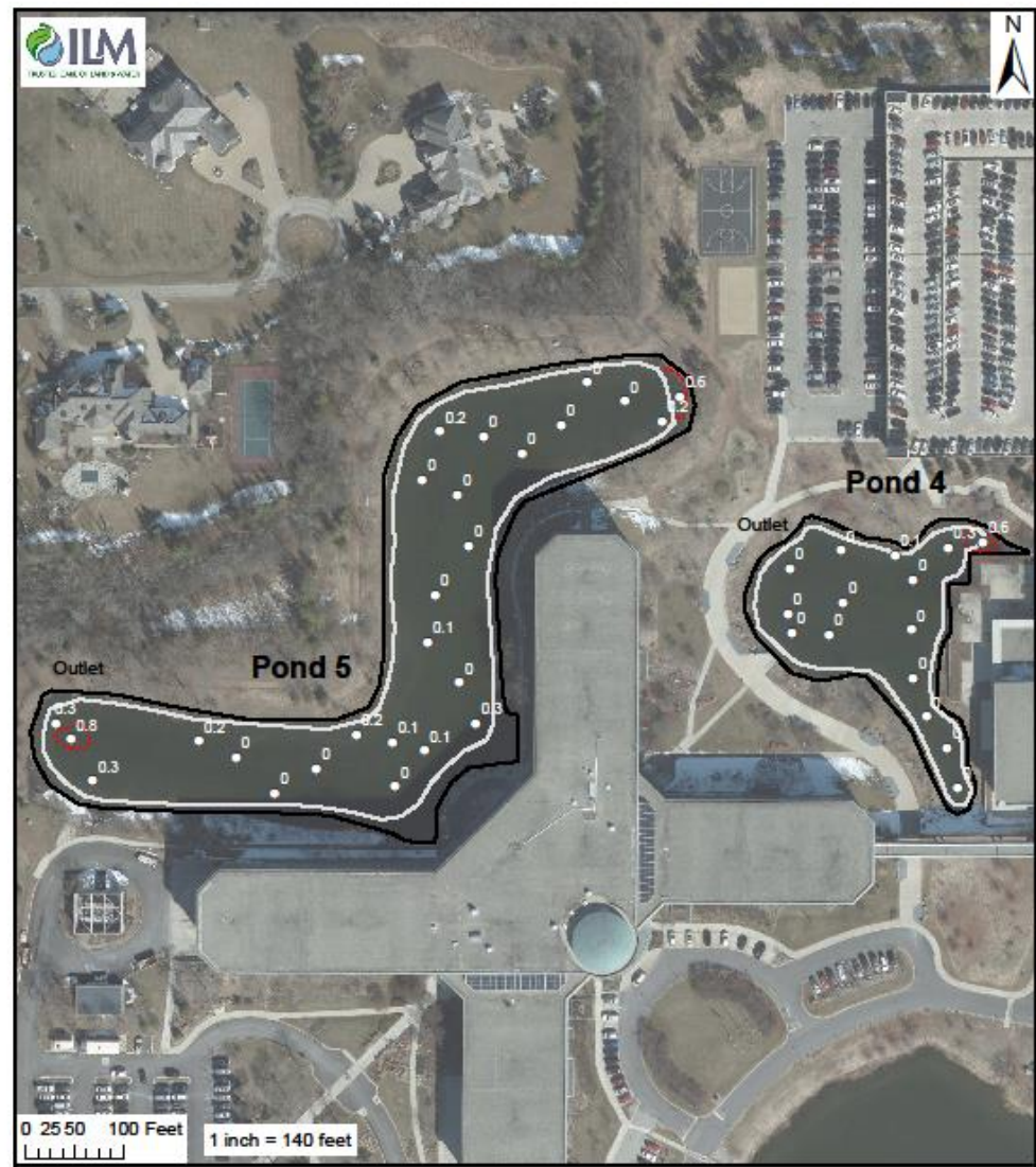
Discover Riverwoods Campus Sediment Thickness Map April 15, 2019