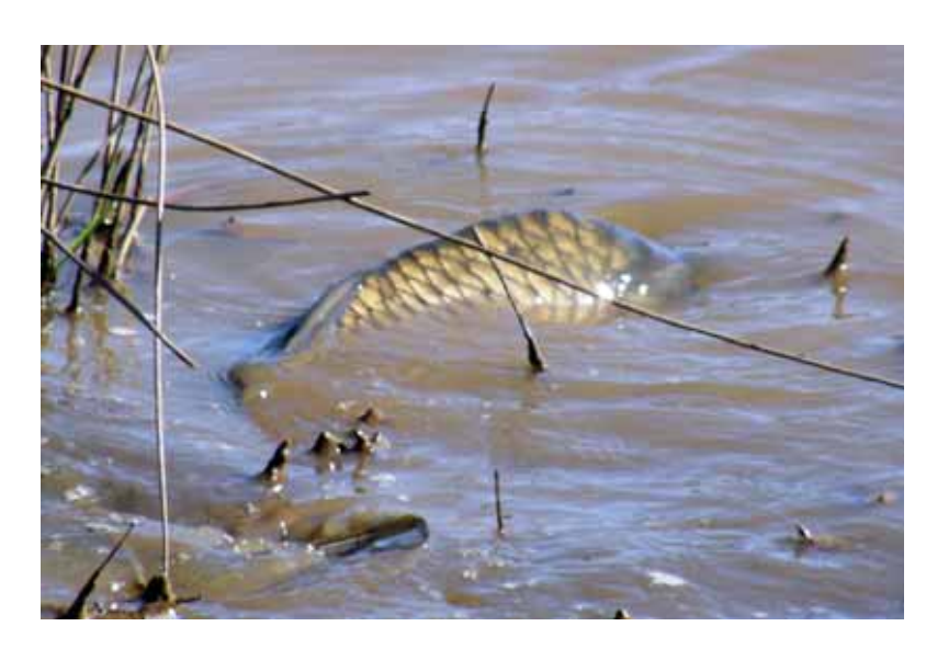
Reduce light penetration