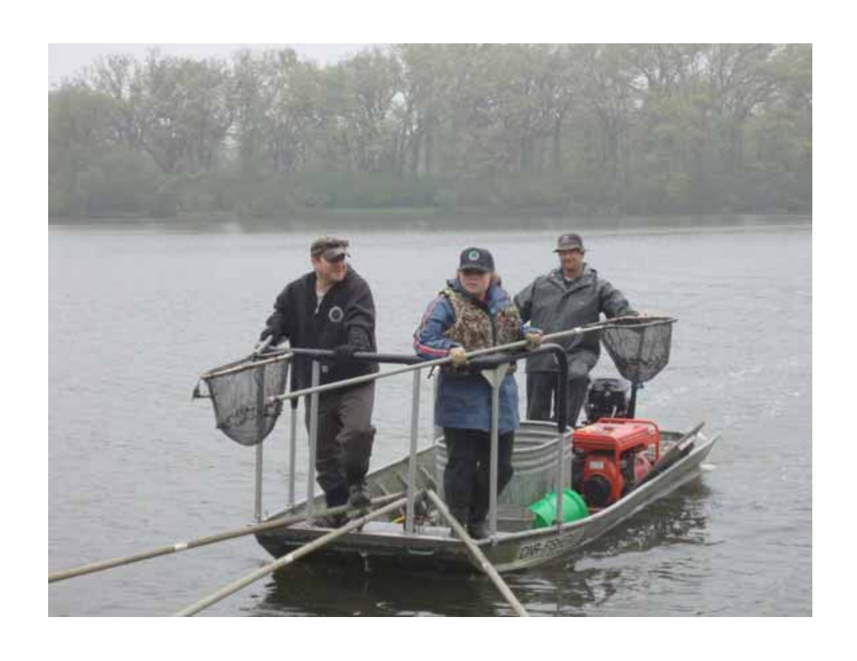
A/C Electrofishing in Smaller Lakes and Ponds